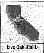
Live Oak, Calif.

AN INFUSION OF $16 MILLION from the American Recovery and Reinvestment Act will enable the rural California city of Live Oak's wastewater treatment plant to avoid tens of thousands of dollars in fines and meet state wastewater quality standards by 2011.